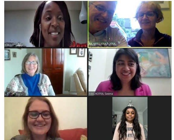
Meeting with Seema Malhotra MP

With the promise of parish life returning to normal soon and over 80% of the population having had the first vaccine, we have grounds for renewed optimism. So let's take a bit of time this summer to pause, reflect and rejoice on what we have done together so far this year.