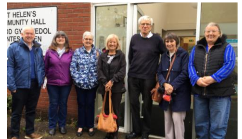
With Wayne David MP, Caerphilly

In addition, 10,000 people signed our climate petition, 2,000 wrote to Rishi Sunak asking him to show leadership and 50,000 young people reminded the Prime Minister that the 'Eyes of the World' were on him.