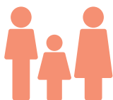
End poverty for all