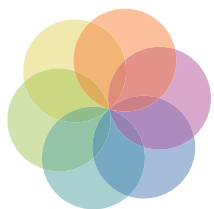
Sustainable Development Goals