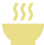
Freedom from hunger