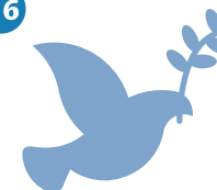
Peace and justice