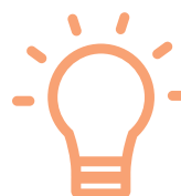
Innovation and infrastructure