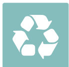
Sustainable consumption and production