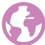
Action on climate change