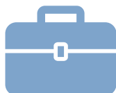
Decent work and economic development